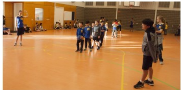
Competition in action.

During the July School Holidays some of our Year 4-7 players attended a MARS Basketball Training Clinic. Two sessions were offered, the first for our Year 4 players and the second for our Year 5-7 players. It was a great opportunity for players to be divided into smaller groups for more intense training than our regular weekly training sessions which are generally larger groups.