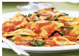
Spinach & Cheese Ravioli in a Napolitano Sauce (Vegetarian)