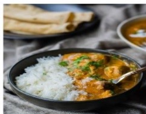
Butter Chicken & Rice (mild)

Order via QKR or with a lunch bag to the canteen