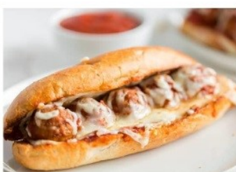
Toasted Meatball Sub

Meatball roll with Napolitano Sauce & grated cheese